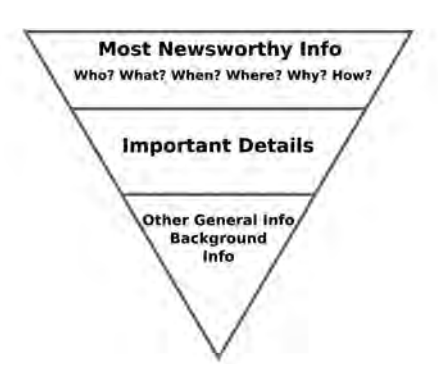
Figure 3. The inverted pyramid

Although scientific documentaries are not news items, they share some of their logic, in the sense that docs, too, must carry facts . However, they need to sustain the attention of the viewer for a longer period of time – docs last 30 to 60 minutes, while a news item runs usually between a minute and a half and three minutes. And there's a reason for the brevity of news items on TV: the medium is very ill-suited to convey facts, because the mere piling up of fact after fact quickly saturates the viewer who, simply, disconnects.